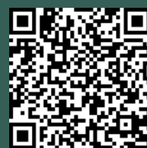
Group 2 Villages